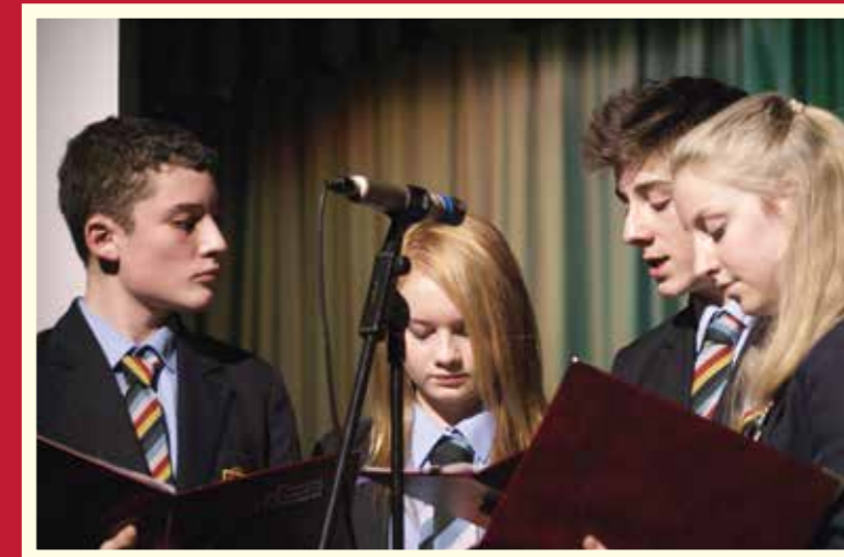
KS3 leaders presenting on the night.