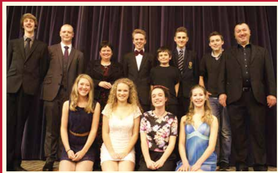
Presenters, organisers and performers on the night.